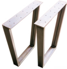
TAPERED LEGS 1" X 3" 14 GA SQUARED STEEL TUBE