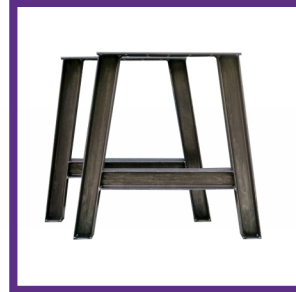
I BEAM STEEL- A SHAPE MATERIALS: C CHANNEL 3X5.7" I BEAM VERY STURDY AND STRONG!