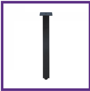
SQUARE LEG MATERIALS: STEEL 2 3/8" SQUARED