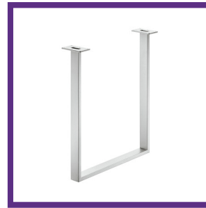
U-LEG MATERIALS: STEEL FINISH: SILVER / WHITE ALUMINUM 2 3/8" TUBE