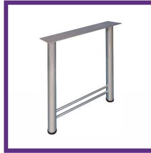
H-LEG MATERIALS: STEEL DIAMETER: 2 3/8" FINISH: SILVER / ALUMINUM OR BLACK WELDED TOGETHER FOR MAXIMUM STRENGTH