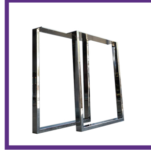
U SHAPE - MIRROR FINISH 2" X 1" 14 GA SQUARED STEEL TUBE SANDED WITH 8 DIFFERENT POLISHES TO ACHIEVE THIS LOOK! CAREFULLY WELDED FOR A SMOOTH CONNECTION!