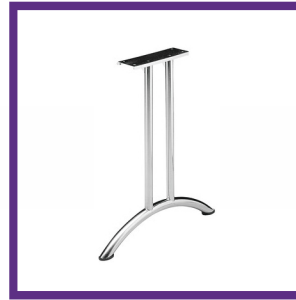
SIDE BASE MATERIAL: STEEL FINISH: CHROME POLISH