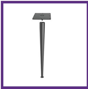
TAPERED E-LEG MATERIALS: STEEL TAPERS FROM 2 3/8" TO 1"