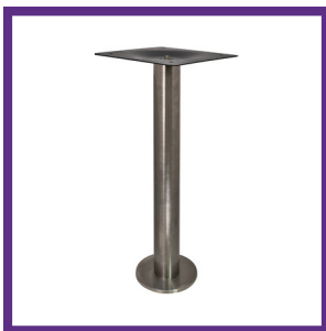
FIXED BOLT DOWN COLUMN MATERIALS: 304 BRUSHED STAINLESS STEEL DIAMETER: 3" BASE: 7"