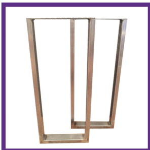
METAL LEGS 2" X 1"