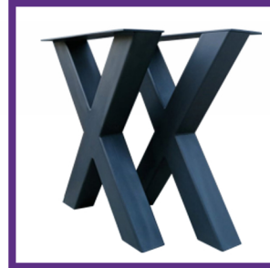
INDUSTRIAL X SHAPE LEGS 4" X 4" 14 GA RECTANGULAR STEEL TUBE