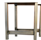
H SHAPE LEGS 2" X 2" 14 GA SQUARED STEEL TUBE