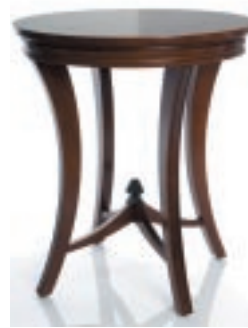
TABLE TOP MANUFACTURING AND RESTORATION SERVICES

If your wood furnishings are in need of major or minor repair, let the professionals at Soft Touch resurface them back to new... or better! Our legendary wood restoration service is the perfect solution for common areas, private dining room tables, arm chairs, hand railings, cabinets, book cases and resident room furnishings. Newly manufactured wood and laminate cabinets are also available for your inner-office and laboratory requirements.